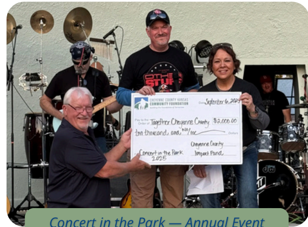
Concert in the Park — Annual Event