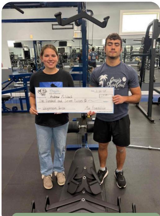
Cheylin Jr. Board Mini Foundation Check presentation