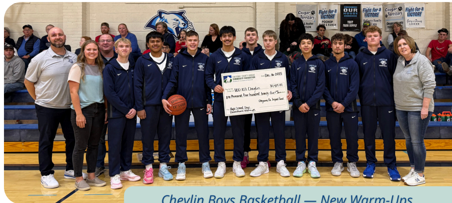
Cheylin Boys Basketball — New Warm-Ups