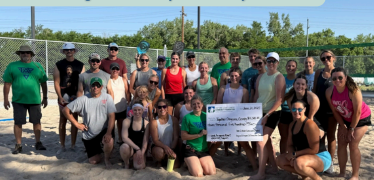
TAP — Tri-Angel Park Sand for the Volleyball Court