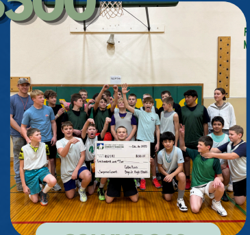
COLLIN ROSS JR High School Boys B-Ball