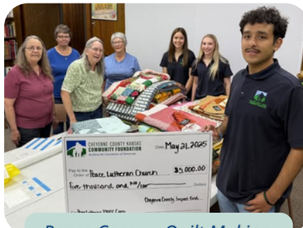
Peace Corp — Quilt Making