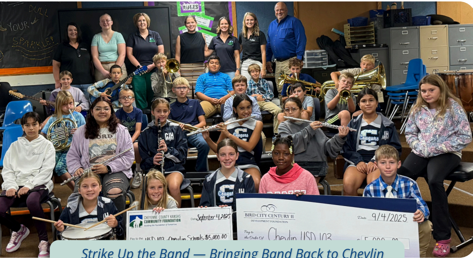
Strike Up the Band — Bringing Band Back to Cheylin