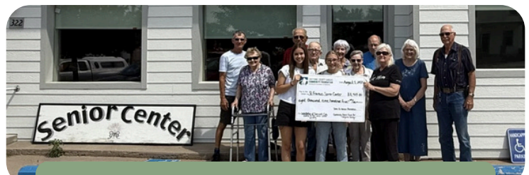
Senior Center — Siding & Revamp of the Kitchen